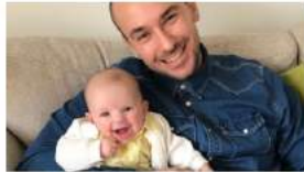
Father's Day – what is all the fuss about?